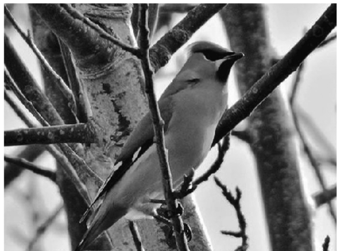
Wangford waxwing – photo courtesy of Geoff Pepper.

And what had they travelled miles to watch? A group of 4 waxwings who hung around for nearly a week launching themselves across the road from one of the bare trees on the playing field to strip the berries from Val's big cotoneaster.