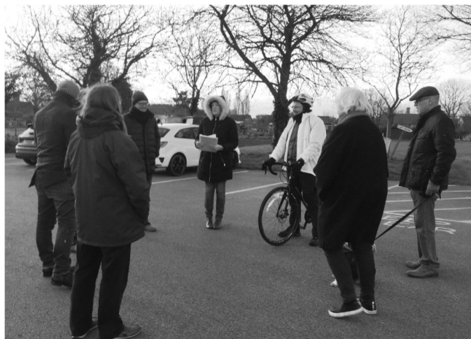
The Parish Council Emergency Meeting in the Centre car park.