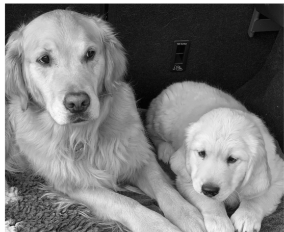
From Revd Alan to cheer us all up. Soleby and little Woody, the latest addition to the vicarage family.

Ring your surgery. They will tell you if you need to go in. Wangford Surgery 578257 Sole Bay Health Centre 722326