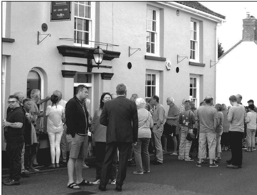
Standing room only, both inside and out, on the Angel Opening Night.