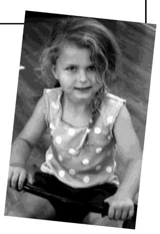
End of term at Toddlers - and off to big school for these two.