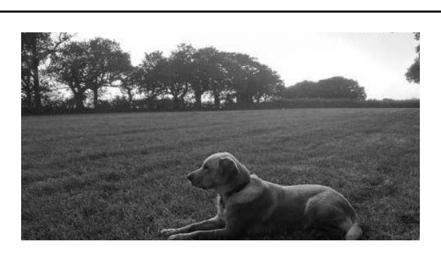
Sotherton Dog Meadow is open. More details on page 7

Afternoon Tea Thursday 25th August 2.30pm Community Centre