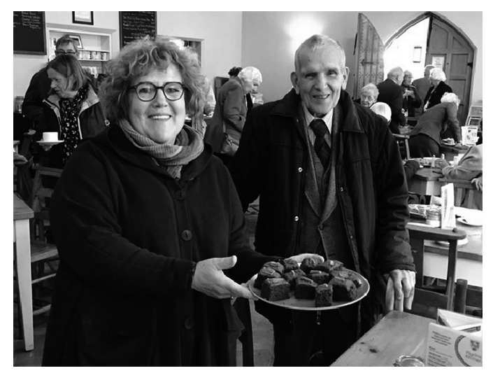
Those chocolate brownies look good!

On Sunday 7th October 42 members of the Sole Bay Team of churches visited our Cathedral in Bury St Edmunds.