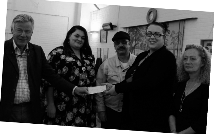
Cheques for £500 presented to local charities First Responders (left) and Access Community Trust for the Homeless (right) from the proceeds of the Uggeshall Teas.