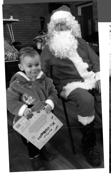
Father Christmas dropped in to Wangford Toddlers