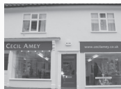
Cecil Amey Opticians HALESWORTH

Our goal at The Hearing Care Centre is to achieve 100% customer satisfaction through taking a personal approach and providing the very highest quality hearing care.