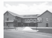
Sole Bay Health Centre REYDON