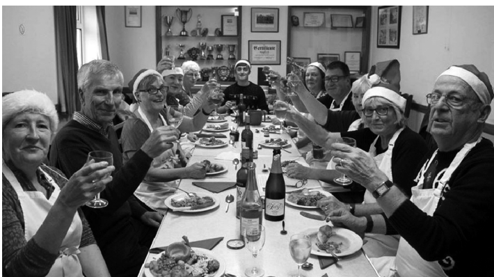
The kitchen and front-of-house teams get to sit down at last to enjoy the fruits of their labours.