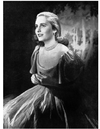
17, newly married, on the cover of Country Life magazine.