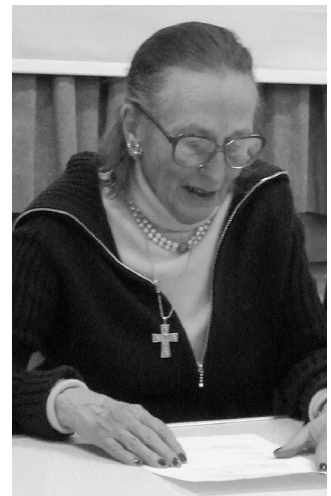
Signing the contract for Raise the Roof Stage 2, in 2011