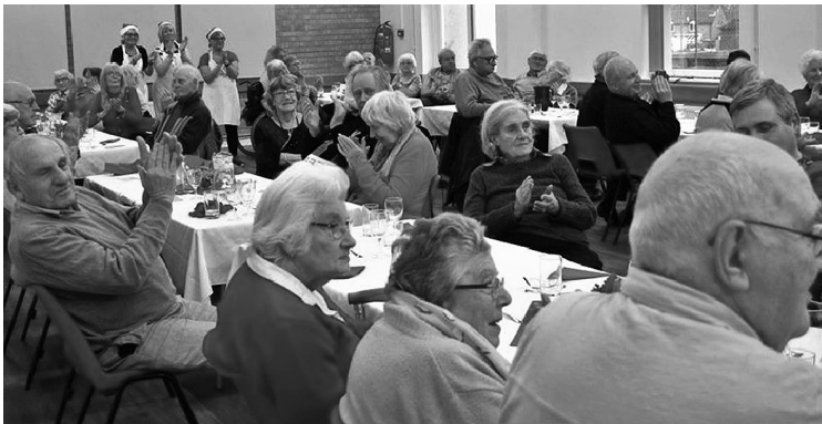
The Sole Bay Singers brought sunshine despite the dismal weather outdoors.