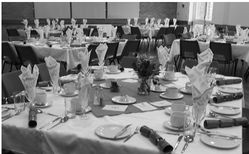
Exquisite table settings transformed the Community Centre into a first-class restaurant

After Covid, it was a great treat to come together in the Community Centre for our Christmas Lunch, cooked and served by the staff and students of East Coast College catering department. 60 guests enjoyed a fine dining experience with delicious food and professional service.