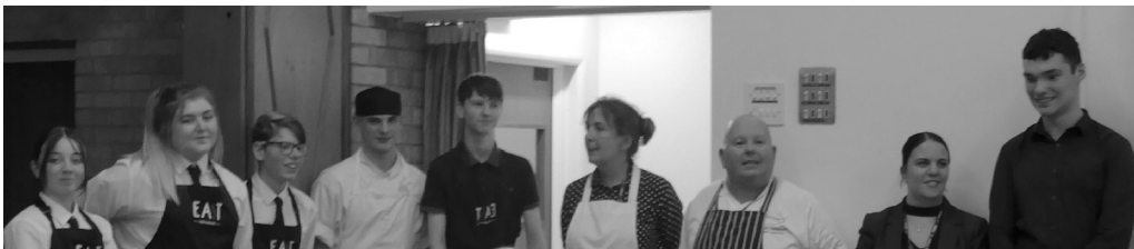
The front-of-house team, who received a well-deserved round of applause from the diners.