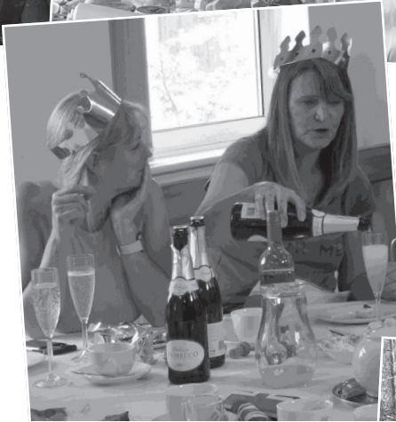
The weather on 8th June was lovely, there was a tremendous turn-out, and a good time was had by all. More photos in the July Messenger.